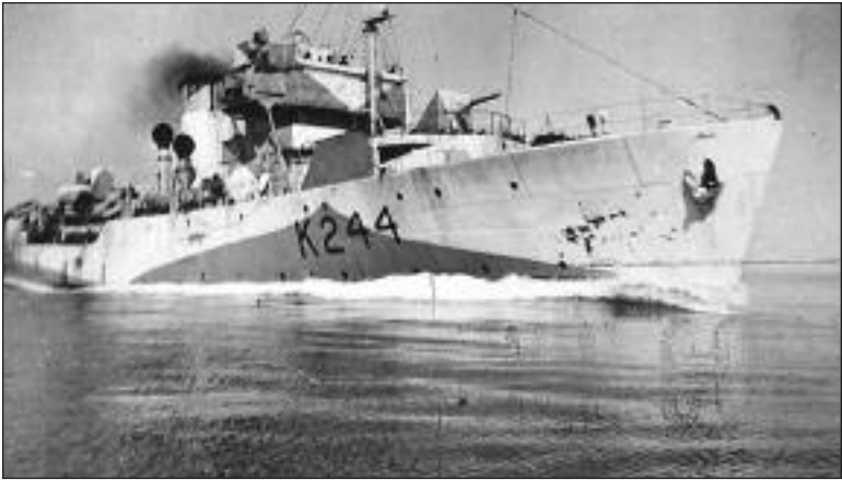
ON SEPTEMBER 11, 1942, HMCS CHARLOTTETOWN (I) WAS DESTROYED WITHIN SIGHT OF HORRIFIED ONLOOKERS ON THE SHORES NEAR CAP-CHAT.

shipping, with its excellent access to Canada's industrial heartland, was a serious threat.