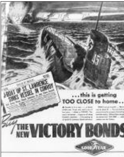
VICTORY BOND ADVERTISEMENT IN THE MONTREAL DAILY STAR, NOVEMBER 2, 1942.

shipping, with its excellent access to Canada's industrial heartland, was a serious threat.