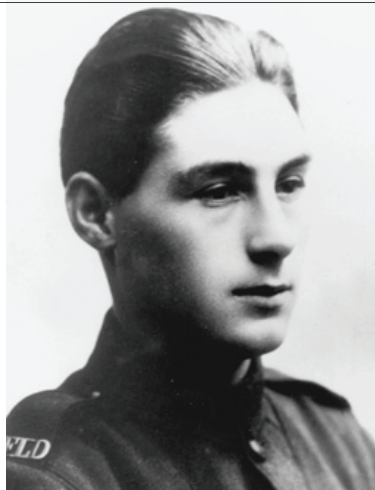
Thomas Ricketts, VC

3. Here is a portrait of Thomas Ricketts. Draw his image in the square.