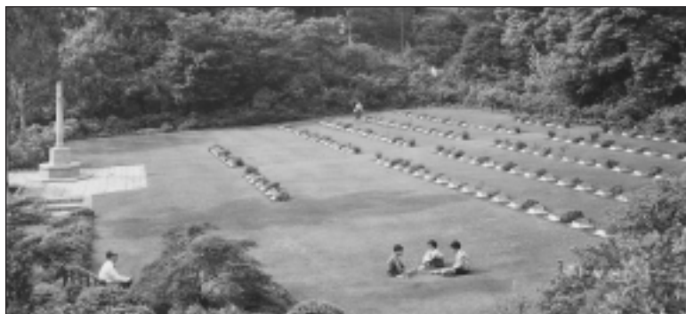
YOKOHAMA BRITISH COMMONWEALTH WAR CEMETERY.