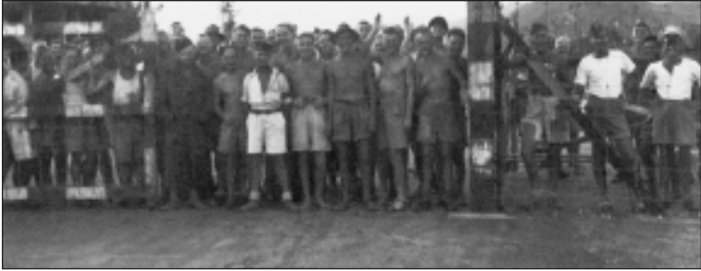
GROUP OF CANADIAN AND BRITISH PRISONERS AWAITING LIBERATION BY LANDING PARTY FROM HMCS PRINCE ROBERT .

The strength of the invasion force was overwhelming, and by early December 19, the Japanese had reached as far as the Wong Nei Chong and Tai Tam Gaps, again proving their effectiveness at night fighting.