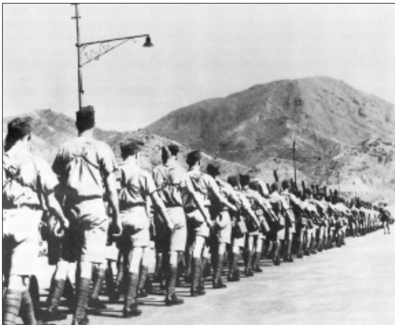
CANADIAN CONTINGENT IN HONG KONG, 1941.