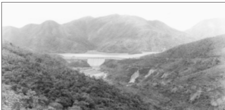
TY TAM TUK RESERVOIR.

The arrival of the Canadians changed the plans for the defence of the colony. The original strategy had called for the main defence to be on the island with only one infantry battalion deployed on the mainland for demolition duties and for delaying purposes. The two additional battalions enabled General Maltby to assign three battalions to the mainland. These battalions would fight from the “Gin Drinkers’ Line”, 18 kilometres of defences stretching across rugged hill country and studded with trenches and pillboxes (concrete bunkers). It was hoped that these additional battalions would protect Kowloon, Victoria harbour, Lye Mun Passage, and the northern areas of Hong Kong Island from artillery fire launched from the mainland. If the enemy launched a major offensive, the mainland battalions would be ordered to complete demolitions, clear vital supplies and sink any remaining ships in the harbour so they would not fall into enemy hands. The remaining forces on Hong Kong Island were to prepare against any Japanese attack from the sea.