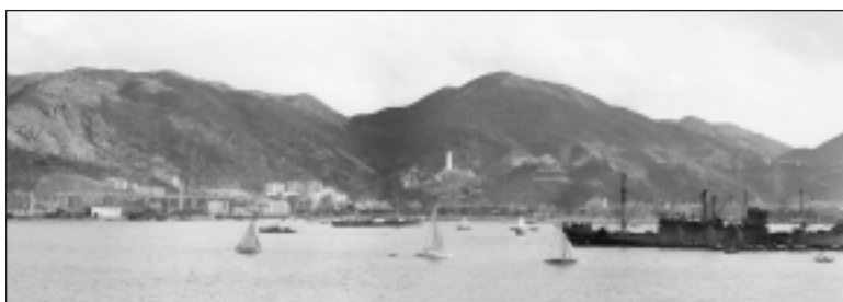
VIEW OF EASTERN HONG KONG FROM HMCS PRINCE ROBERT , NOVEMBER 19, 1941.

The defence of Hong Kong was made at a great human cost. Approximately 290 Canadian soldiers were killed in battle and, while in captivity, approximately 267 more died as POWs, for a total death toll of 557. In addition, almost 500 Canadians were wounded. Of the 1,975 Canadians who went to Hong Kong, more than 1,050 were either killed or wounded. This was a casualty rate of more than 50%, arguably one of the highest casualty rates of any Canadian theatre of action in the Second World War.